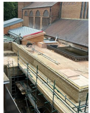
The new toilet block now has a roof!