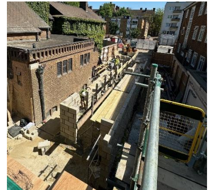
The beginnings of the toilet block!

You can donate to the Parish Centre Appeal using the card machines, by cheque or directly to the bank ( a/c name: RCAS The Most Holy Trinity Bermondsey Dockhead, sort code: 60-21-34; account no: 35542705 ), or scan the QR code. Please gift aid if you can.