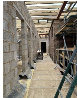
The new toilet block now attached to the sacristy wall

You can donate to the Parish Centre Appeal using the card machines, by cheque or directly to the bank ( a/c name: RCAS The Most Holy Trinity Bermondsey Dockhead, sort code: 60-21-34; account no: 35542705 ), or scan the QR code. Please gift aid if you can.