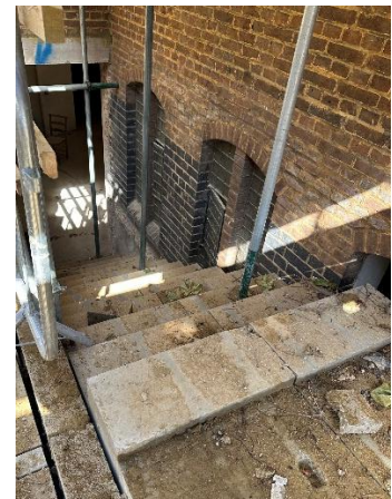
The Stairway now in place! The stairs down to the new undercroft area!

You can donate to the Parish Centre Appeal using the card machines, by cheque or directly to the bank ( a/c name: RCAS The Most Holy Trinity Bermondsey Dockhead, sort code: 60-21-34; account no: 35542705 ), or scan the QR code. Please gift aid if you can.